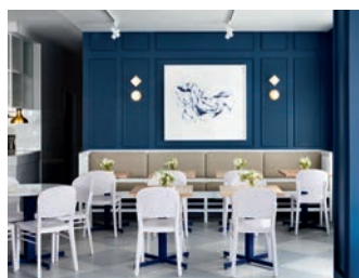
The diamond shaped tiles bear a resemblance to Westminster Abbey's

Taking inspiration from the Duchess of Cambridge, Middletown Café features walls painted in rich shades of royal blue, muted grey tiles, and stark white furniture. Must-have: the avocado on polenta, topped with sweet potato croquette and poached eggs. 229 High St, Prahran VI, Australia. www.middletown.com.au