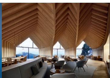
Local spruce, oak, and larch were used in the construction of the restaurant

Taking inspiration from the Duchess of Cambridge, Middletown Café features walls painted in rich shades of royal blue, muted grey tiles, and stark white furniture. Must-have: the avocado on polenta, topped with sweet potato croquette and poached eggs. 229 High St, Prahran VI, Australia. www.middletown.com.au