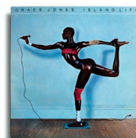
Island Life by Grace Jones, photographed by Jean-Paul Goude